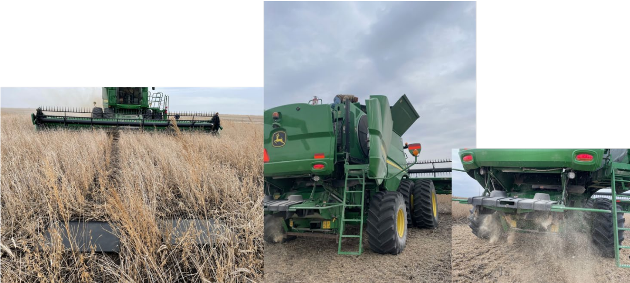
Measuring header, grain tank, and thresher loss of waterhemp seeds, Dayton, IA 2022